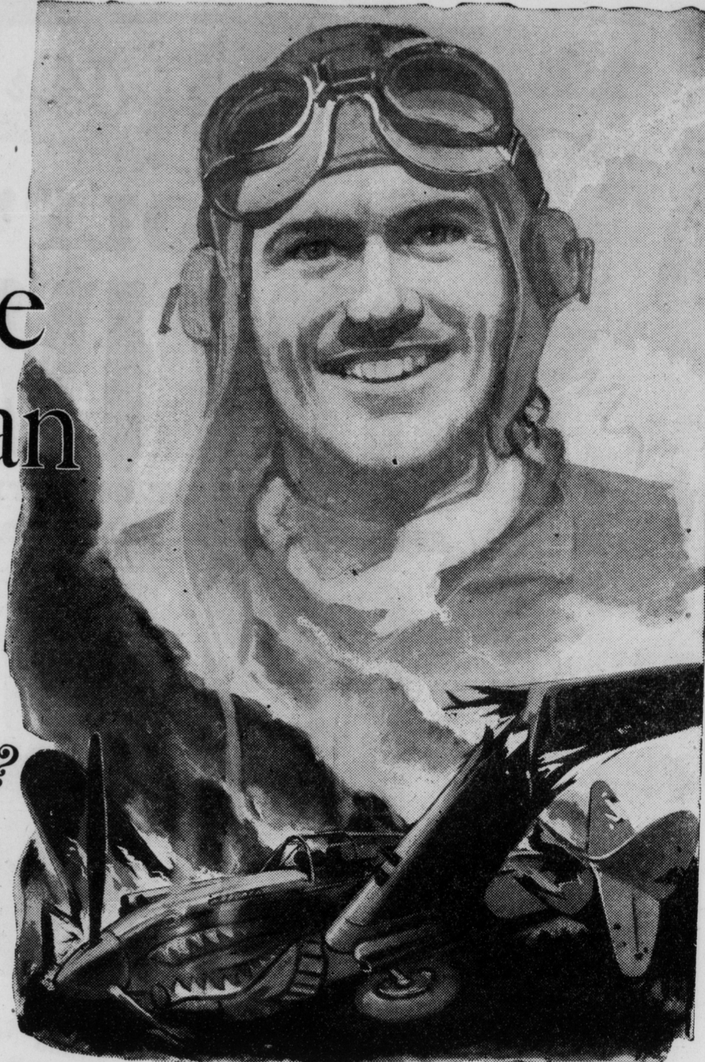
THE STORY OF SCARSDALE JACK of the Flying Tigers

...and you're not even being asked to give, but to invest in your own future and make a handsome profit besides!