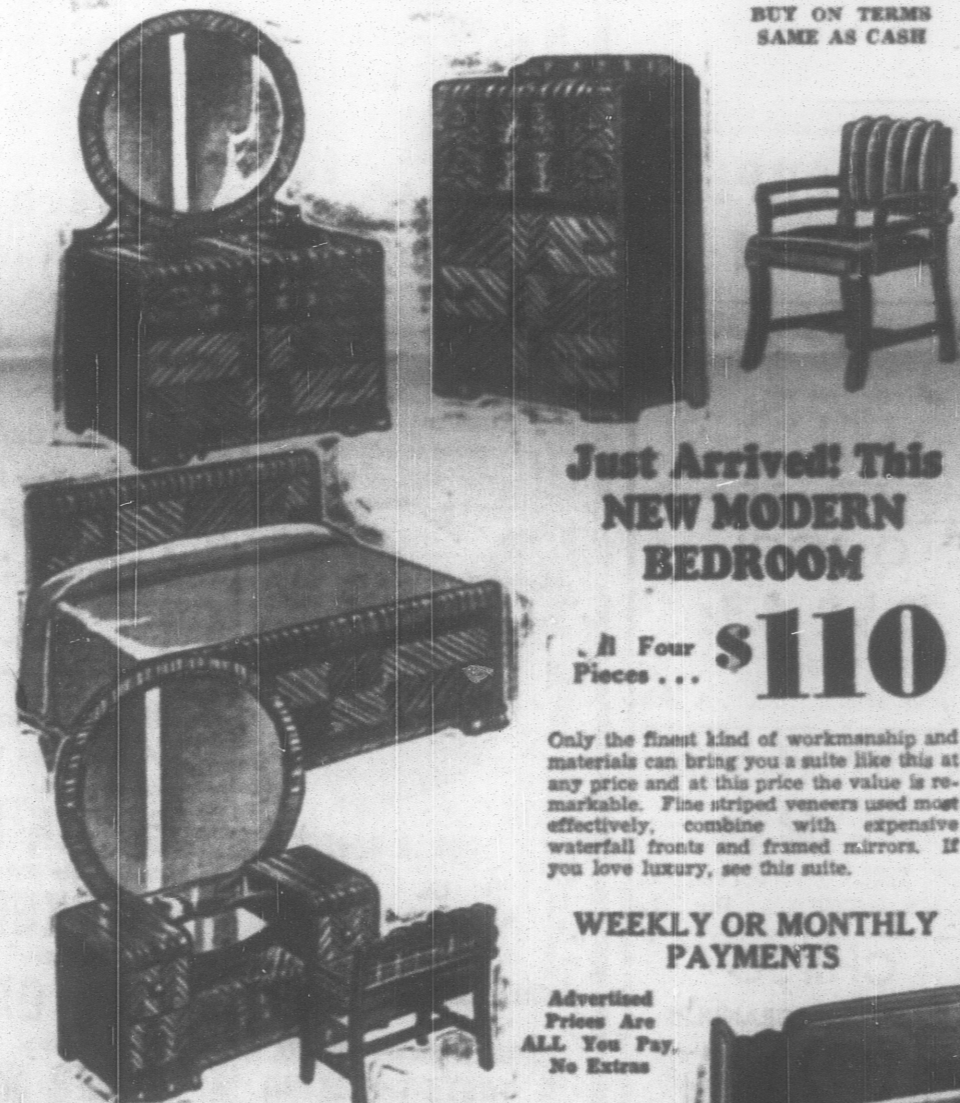
Just Arrived! This NEW MODERN BEDROOM