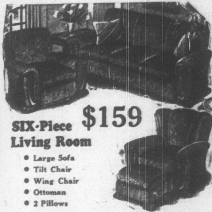
SIX-Piece $159 Living Room

We grouped them at this special price for immediate shipment and the values are remarkable. In a wide choice of colorings and every size, if you come early enough.