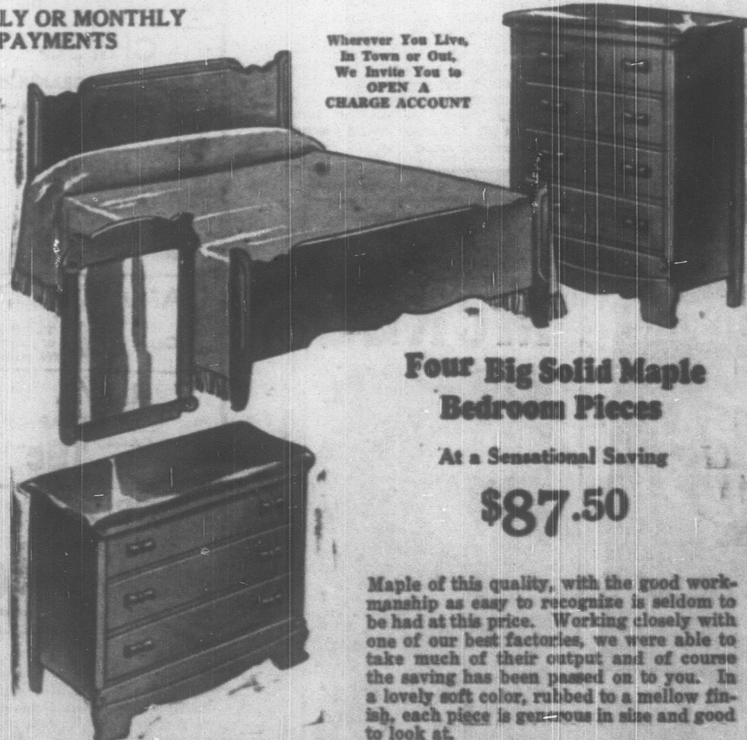
Four Big Solid Maple Bedroom Pieces

Wherever You Live, In Town or Out, We Invite You to OPEN A CHARGE ACCOUNT