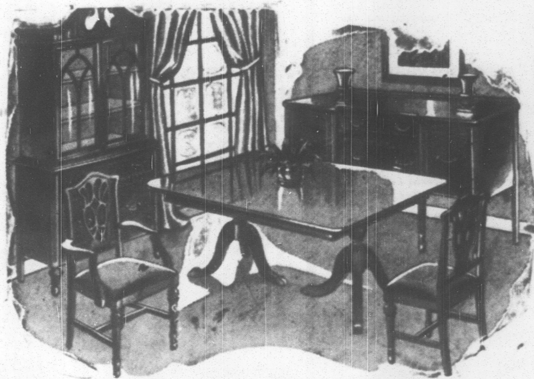
9-Pc. 18th Century Dining Room

A moment's thought, after you glance at this sketch, and you'll visualize what an impressive, gracious, charming room this suite will give you. Not only does it bring you all the authentic details that make this type of furniture so lovely but it has all the QUALITY details for which you'd expect to pay twice as much. In walnut or mahogany. Which do you prefer?