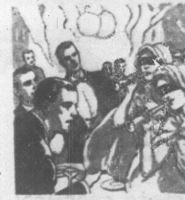
In Rashed a Band of Masqueraders Waving Banners.

The stag party, ablaze with lights, was in full swing, the very air permeated with the rip-roaring,