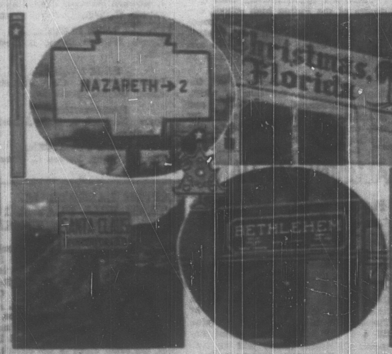
It's Christmas the year around where these pictures were taken: Christmas, Fla.; Bethlehem, Pa.; Nazareth, Pa., and Santa Claus, Ind. Each year thousands of Christmas cards are forwarded to postoffice at these communities for stamp cancellation.

In democracy, that they will derive its strength and enlarge democratic methods, that they will be active partners of God, practicing a high ethic and being generous, fair, firm, tolerant, calm, courageous. What kind of history of tomorrow are we writing in the lives of our children today?