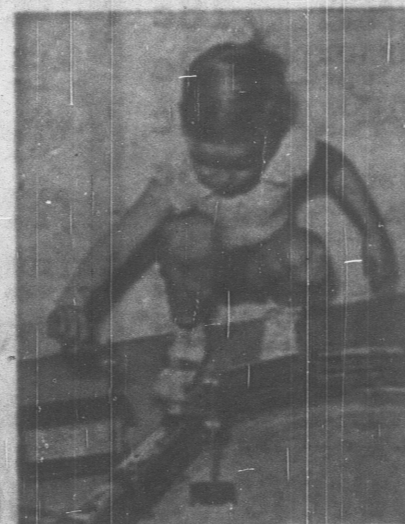
Too many toys confuse the child.

Most children are flooded with so many toys on Christmas day that they're positively bewildered and therefore jump from one plaything to another uncertainly. This is why so many child experts recommend that mothers take away and store out of sight certain of the youngsters' new possessions. When a spell of bad weather comes later to