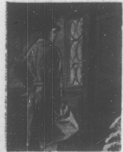
He ascended the steps leading to the massive door.

mas he had been anticipating. Aft- terrupted.