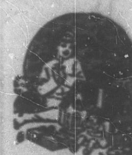
LIFELIKE DOLLS Pairley drinks, wets, and

17. in. black Princess Betty . large, glass like eyer and $2 solid rubber body