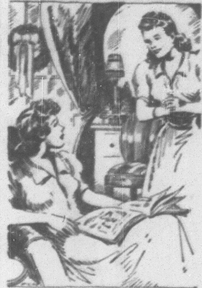
"I've thought of something!" she cried breathlessly.

that would be delivered at the little cottage on Bark street. They both seemed to be more concerned