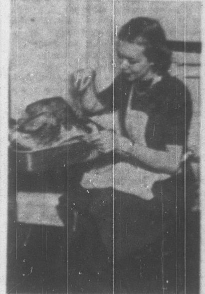
Allow 20 to 25 minutes to the pound for roasting bird in 325-degree oven.

An excellent dressing is the apple-and-raisin variety, made with the