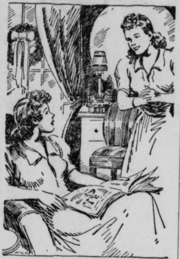
"I've thought of something!" she cried breathlessly.

that would be delivered at the little cottage on Bank street. They both seemed to be more concerned