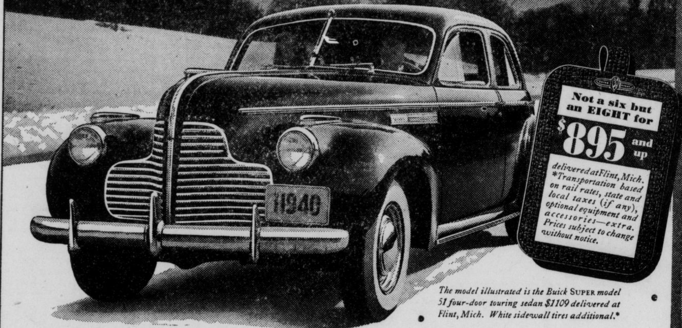
The model illustrated is the Buick SUPER model $1 four-door touring sedan $1109 delivered at Flint, Mich. White sidewall tires additional.*

YOU look this smooth-stepping Buick honey over, and its very manner tells you here's a one-in-a-million kind of automobile.