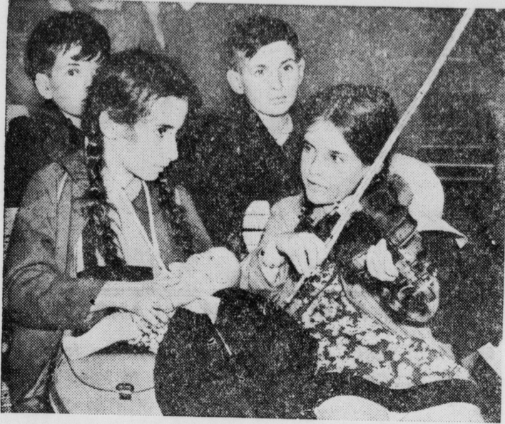
The spirits of these tiny waifs from Germany were buoyed temporarily when one of their numbers struck up a tune on her violin as 150 refugee children arrived at the Liverpool, London, station. Homes had been found for the children previous to their arrival, and excitement kept them from becoming completely despondent.