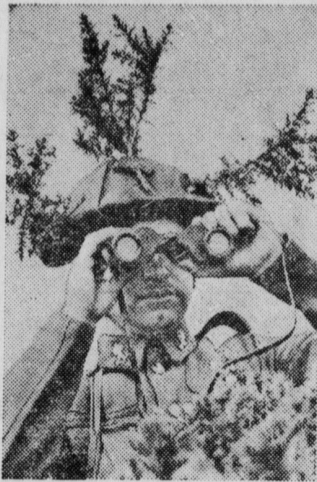
The vegetation springing from this British soldier's helmet is for protective, not nutritive, purposes. The camouflaged helmet cover conceals him as he watches for the "e.e.e.y" during mimic warfare maneuvers.