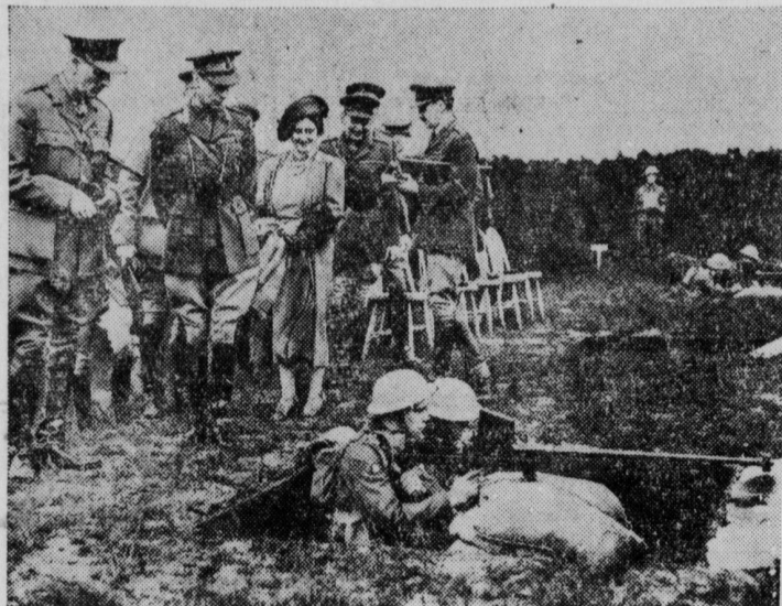
King George VI, second from left, and Queen Elizabeth are shown watching an anti-tank rifle in action repulsing an "enemy" attack in a sham battle at Stony Castle, Aldershot, England. The king pored over maps with the field commander, while the queen listened intently to the explanation of Britain's latest defense technique.