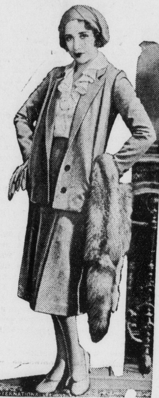
This fashionable tailored suit is designed from mottled gray French woolen coating. The blouse is crepe de chine in the popular off-white shade. A gray fox scarf and beret in matching color complete the costume.