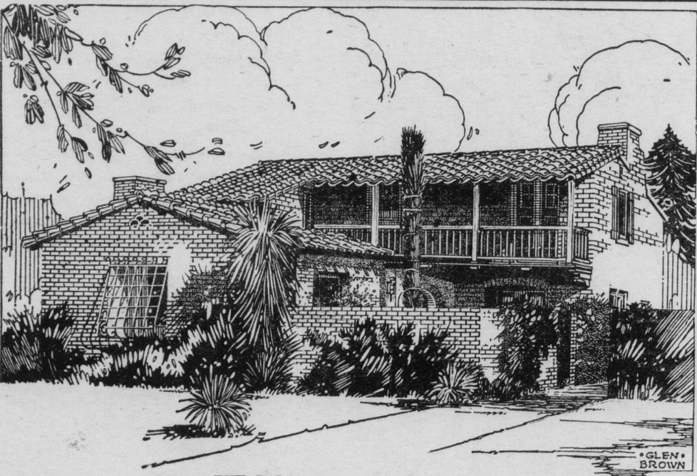
THE PALO ALTO—DESIGN NO. 805

LAZILY basking in the bright California sunshine this quaintly old-fashioned home—stead, with its semi-tropical shrubbery and trees, is like a whiff out of Mexico or Old Spain. It is distinctly Spanish in every line, from the tiled roof to the grilled windows and the wall enclosed patio off the living room. And how eloquently the primitive railed porch on the second floor speaks of the siesta! This is essentially a Southern type of home. It isn't equipped for the severe temperature of a Northern winter. It lacks a 'urnace and all the rest of the necessary heating system. In California the big open fireplace in the living room is sufficient for cool evenings, and winter never comes in the sense we Northerners know it. But the heating equipment could be added with no extortionate cost. And after all, when one studies the floor plans and fully appreciates you the admirable arrangement there is no denying that it reaches out to