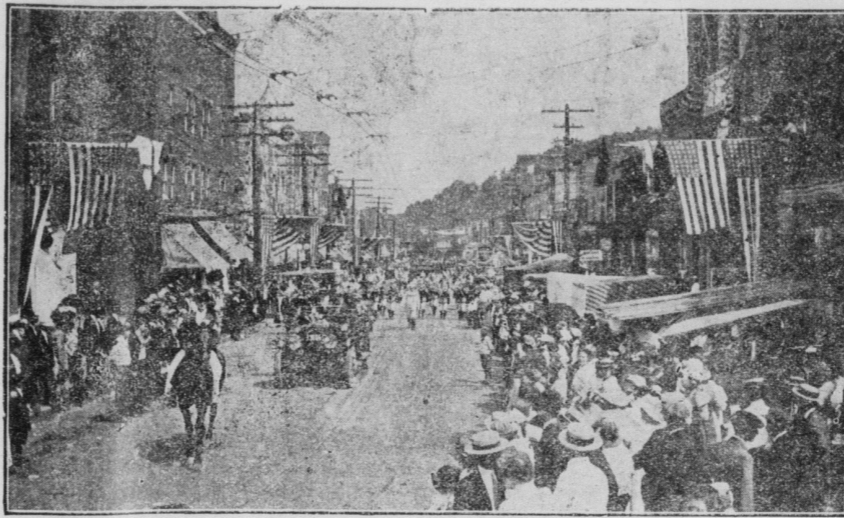
When the Patton Fire Company first entertained the Central Convention back about seven- teen years ago, and the line of parade coming up Magee Avenue look like this?