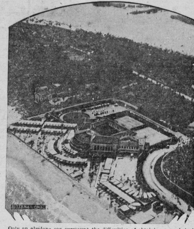
Only an airplane can surmount the difficulties of obtaining a peek inside the exclusive Bath and Tennis club of Palm Beach, Fla. It is the winter bathing place of the socially elect from all over the world.

sinated died without making a will. one of the three women. It is likely that the estate will be divided among