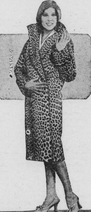
This colorful leopard skin coat for sports wear is fashioned in a youthful up-and-down line. This coat is ideal for all out-of-door occasions.