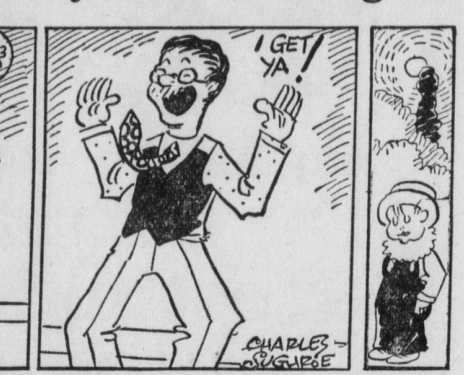
YALE PIGSKIN COACH