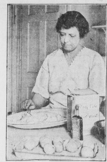
Preparing Eggs for Angel Food.

(Prepared by the United States Department of Agriculture.) The time to indulge a taste for angel food is of course in the spring when the hens begin to lay generously. Because a good many whites and no or "food," most thrifty housekeepers make soft custard sauce from the with the cake, or reserve it for another dessert. If one happens to be is also good with asparagus, which beare abundant also. The bureau of home economics gives these directions