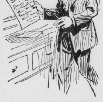
There Was a Note on His Dresser.