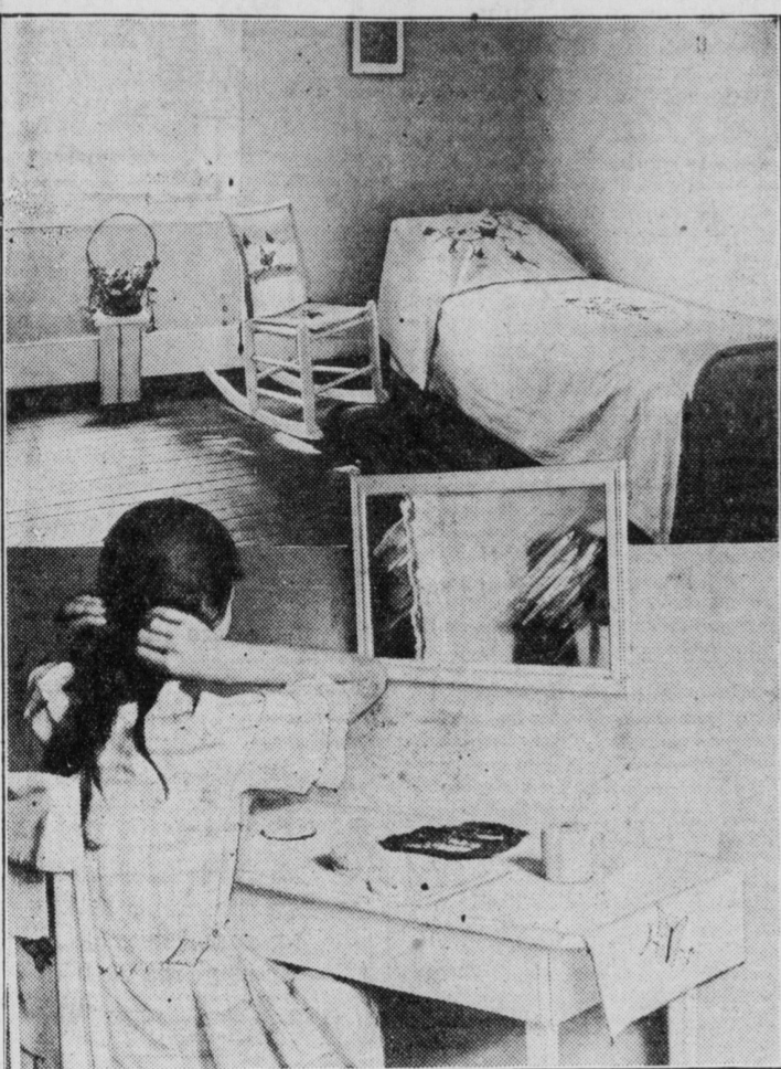
View of Ruby Bing's Room and Dressing Table.