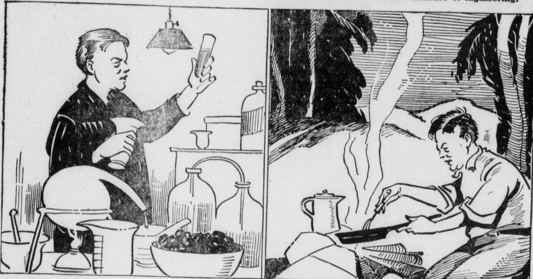
3. His leisure time was spent in scientific experiment in his own private laboratory.