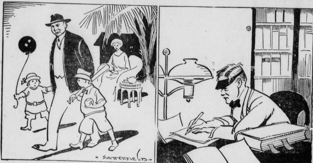
1. After their romantic years in China the Hoovers settled down in America with their two boys.