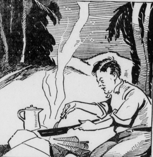
4. Camp life was his vacation hobby. He is the only man who can poach an egg on the end of a stick.