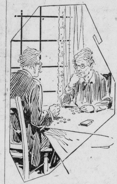
The Husband Swallowed First; Then the Wife Took One.

Death had no terrors for this pair. They talked the thing over and reafinds that the expectation of life which soned that if their usefulness had passed its zenith, the grave would be better than that they should become for American women at average age a burden to each other or to relatives. So they decided to die-to die together and meet, they hoped, in a hap-