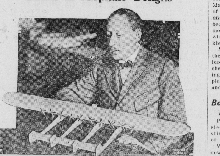
Doctor Rumpel of Germany, renowned designer and builder of airplanes and his latest model of a plane which will be built for transoceanic flights. This giant will be four planes in one, will have ten motors and a wing spread of 310 feet.