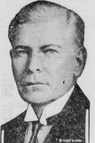
Most recent photograph of Elmer Thomas, the new United States senator from Oklahoma. He succeeded John William Barred.