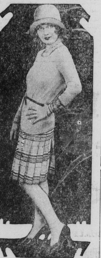
A most becoming costume for sport events is this horizontally striped skirt with a jersey sweater as worn by Alice White, First National player. A narrow belt is worn along with a felt hat of vagabond lines.