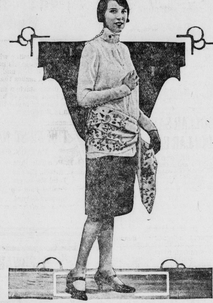
Blouse Trimmed With Embroidery.

are the possessor of a blouse which | vincing as black with white. Starwill excite both the envy and admira- tling effects as here pictured are the