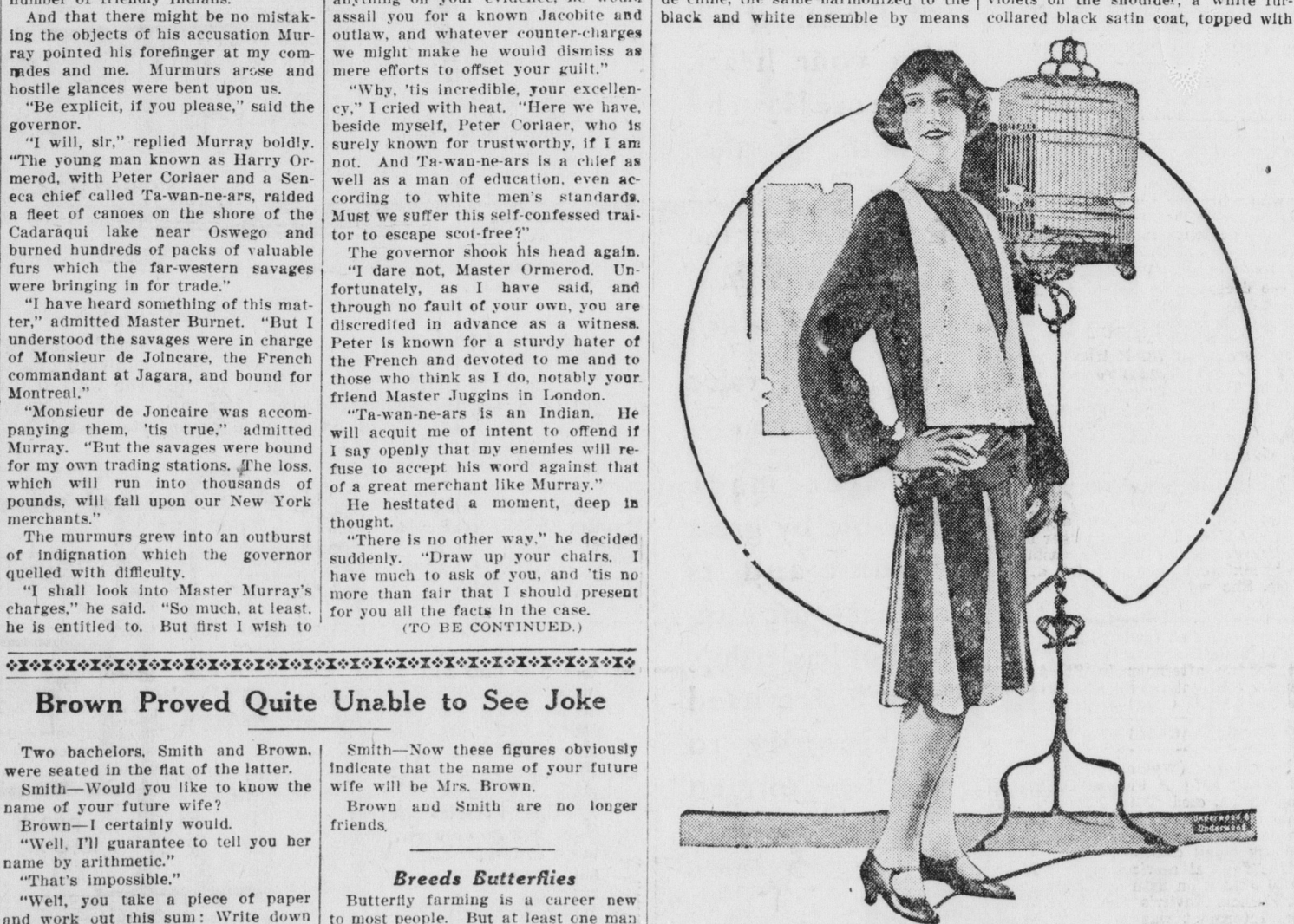
Startling Effects Stylists' Pride.

Methods of interpreting the blackand-white vogue are many and varied. Some there are who prefer the anything on your evidence, he would de chine, the same harmonized to the violets on the shoulder, a white fur-