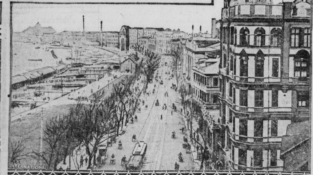
Scene on the Bund, in the international quarter of Shanghai which the Chinese demand shall be given up and which Great Britain has prepared to defend.