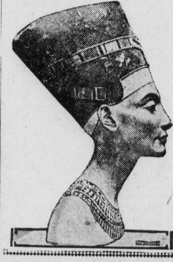
This bust of the Egyptian Queen Neferti, taken from an excavation at Tel-el-Amarna by Doctor Burchardt, noted German archeologist, and now in the Berlin museum, is the subject of diplomatic correspondence. The Egyptian government, it is reported, has refused to allow Doctor Burchardt to resume excavations because he smuggled the bust out, and until its return he will continue to be tion in Germany.