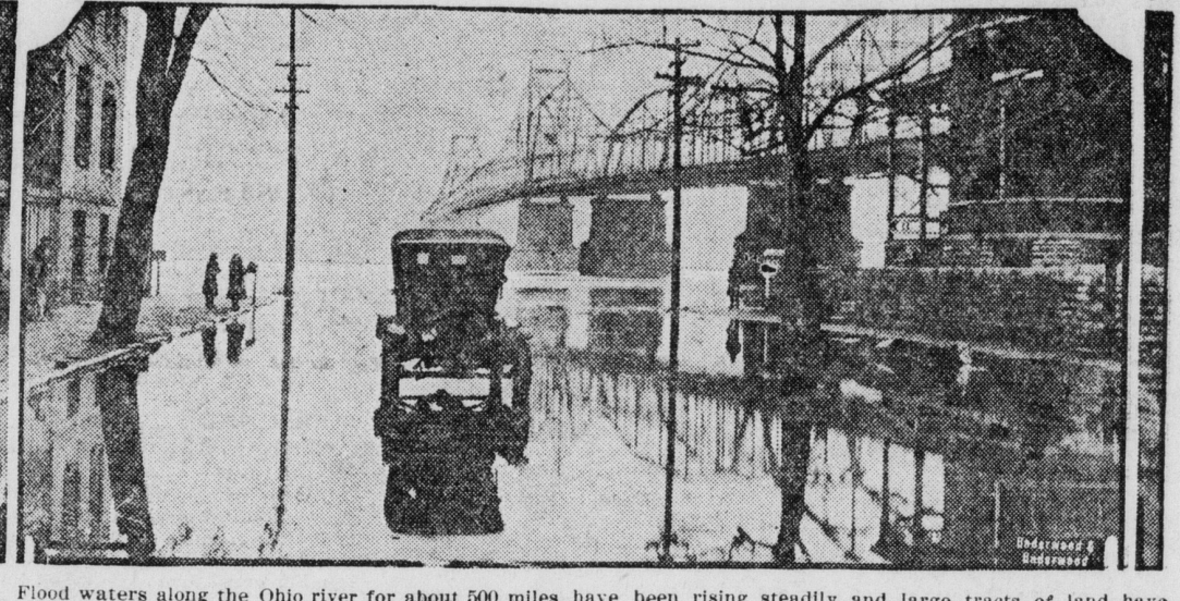
Flood waters along the Ohio river for about 500 miles have been rising steadily and large en submerged. This photograph shows the high water in a street of Newport, Ky.