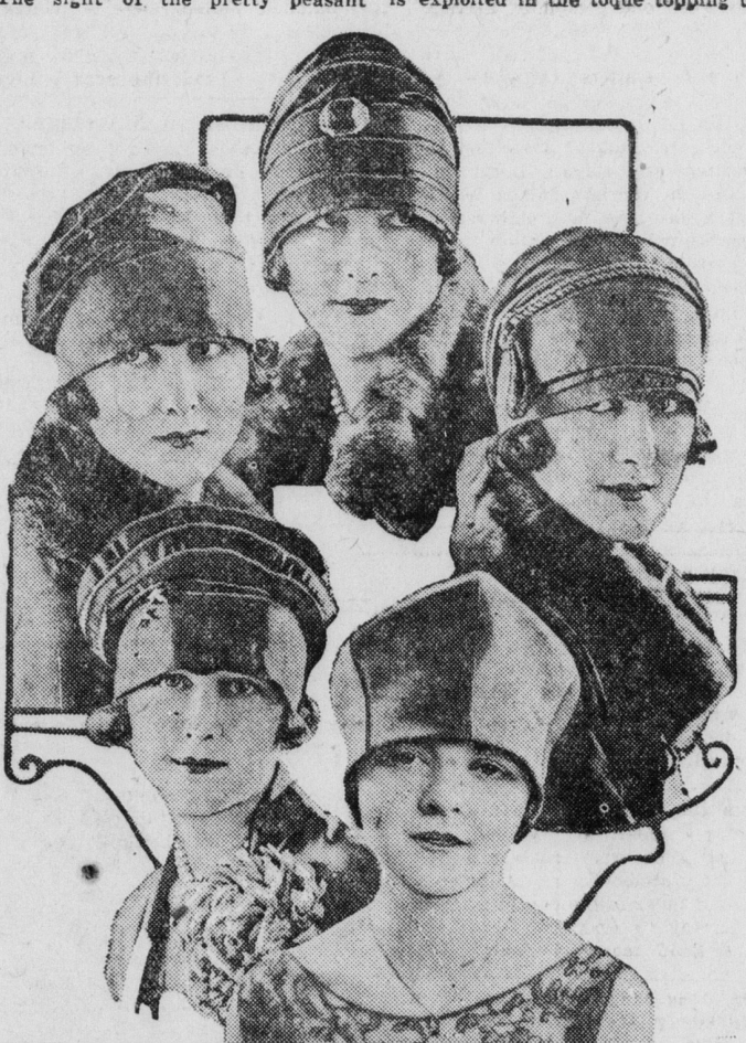
Some Between-Seasons Hats.

The use of narrow grosgrain ribbon The sight of the pretty peasant is exploited in the toque topping this