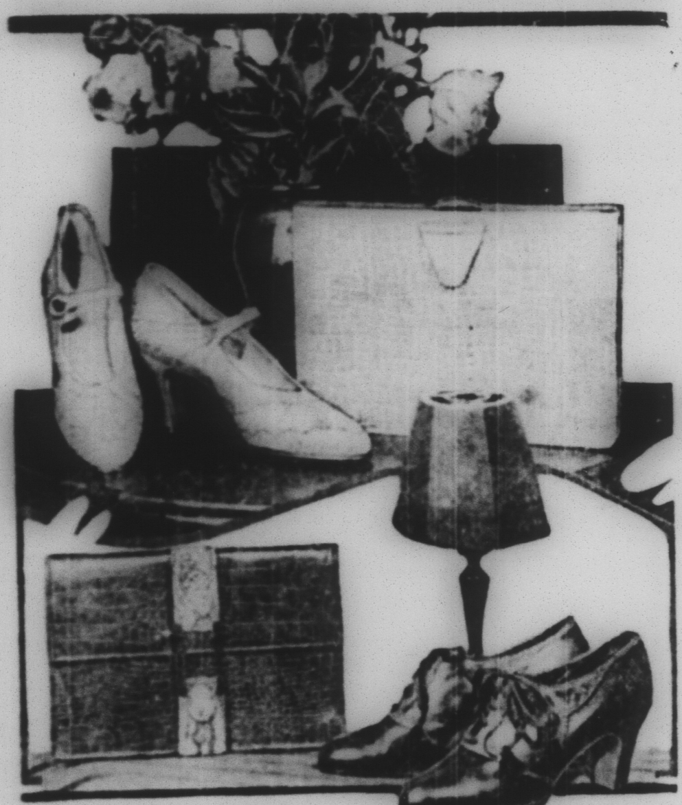
DISPLAYING REAL ARTISTRY