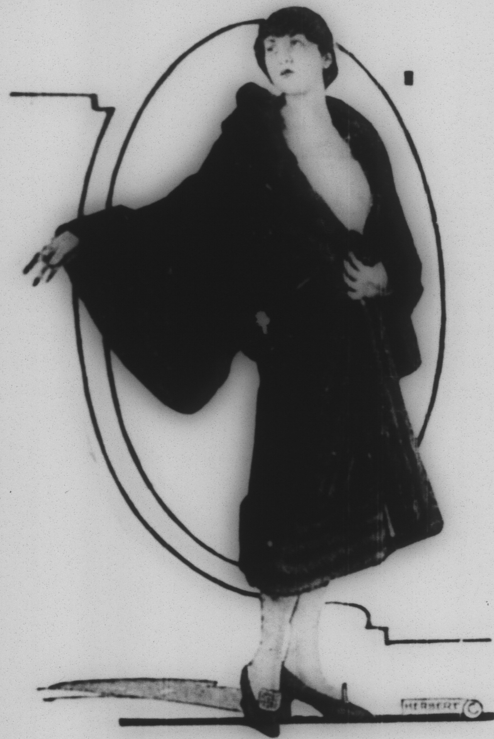
AN EXQUISITE EVENING WRAP