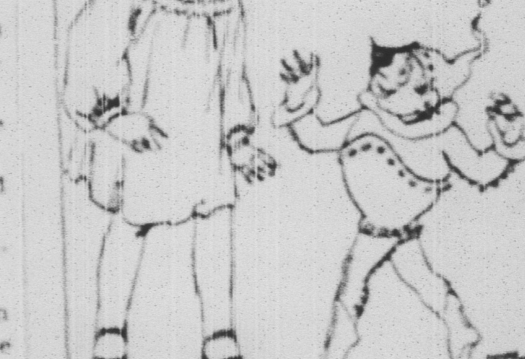
Someone Bade Her a Polite Farewell.

THAT LOST HOUR Mahalla had simply lost an hour that day. She really had not known what had happened to it and then, wonder of wonders, a little gnome had appeared. His name was Someone and it was he who was the creature meant when people said that "Somebody" must know or that "Somebody" could do this or that.