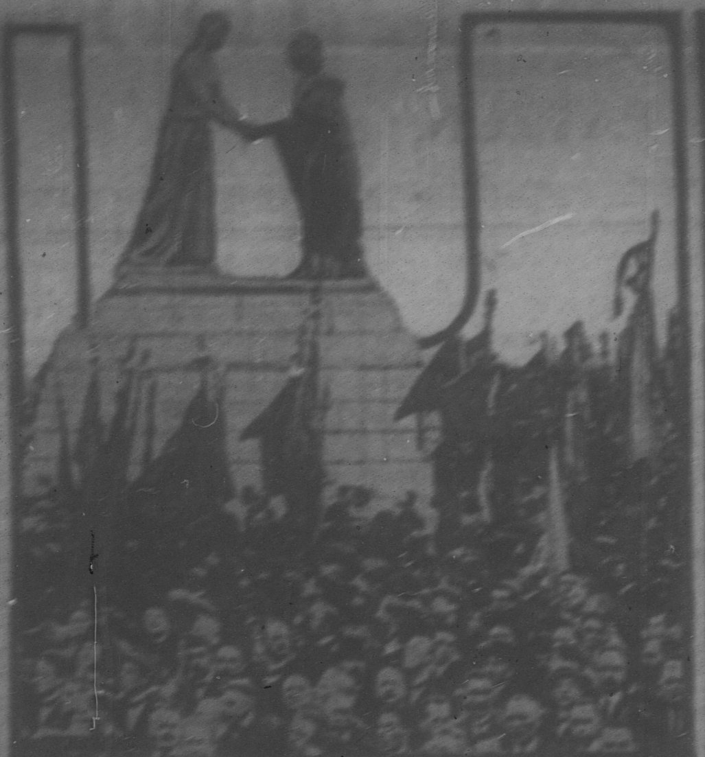
Beautiful memorial at Le Havre, which Belgium has presented to France as a token of thanks for the help given by France during the World War.