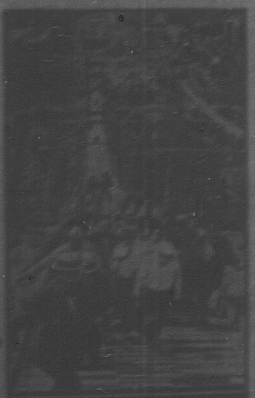
Workers of the Pennsylvania-New Jersey bridge are busy with the final stages of the construction. The bridge will connect Philadelphia and Camden, the largest metropolitan bridge in the world.