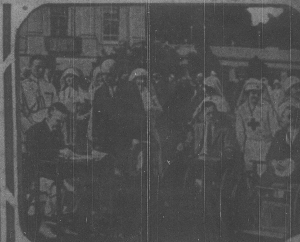
President and Mrs. Coolidge entertained the disabled service men in the army, navy and public health hospitals in the vicinity of Washington and several thousand veterans enjoyed their hospitality in the lovely White House gardens. President Coolidge is shown signing the hospital bill drafted by the veterans bureau and passed by both houses which appropriates $1,500,000 to carry on the hospital program to take care of the disabled veterans.