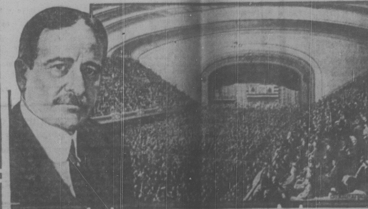
This is the official photograph of the Republican national convention in session at Cleveland. The inset is Frank W. Mondell of Wyoming, permanent chairman of the convention.