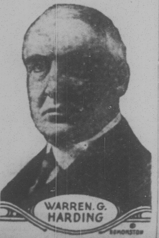
WARREN G. HARDING

The Governor will be the guest of honor at the celebration of the Labor Day. The Governor will be the guest of honor at the celebration of the Labor Day. The Governor will be the guest of honor at the celebration of the Labor Day.