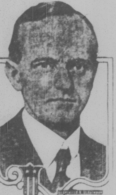
Vice President of the United States Who Will Be Obligated As President at Once.