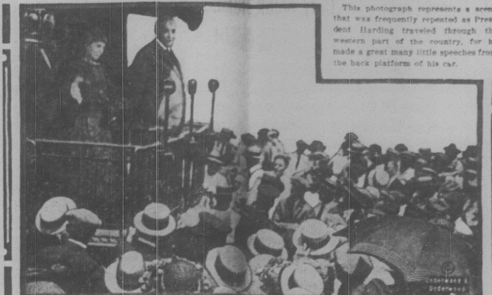
This photograph represents a scene that was frequently repeated as President Harding traveled through the western part of the country, for he made a great many little speeches from the back platform of his car.