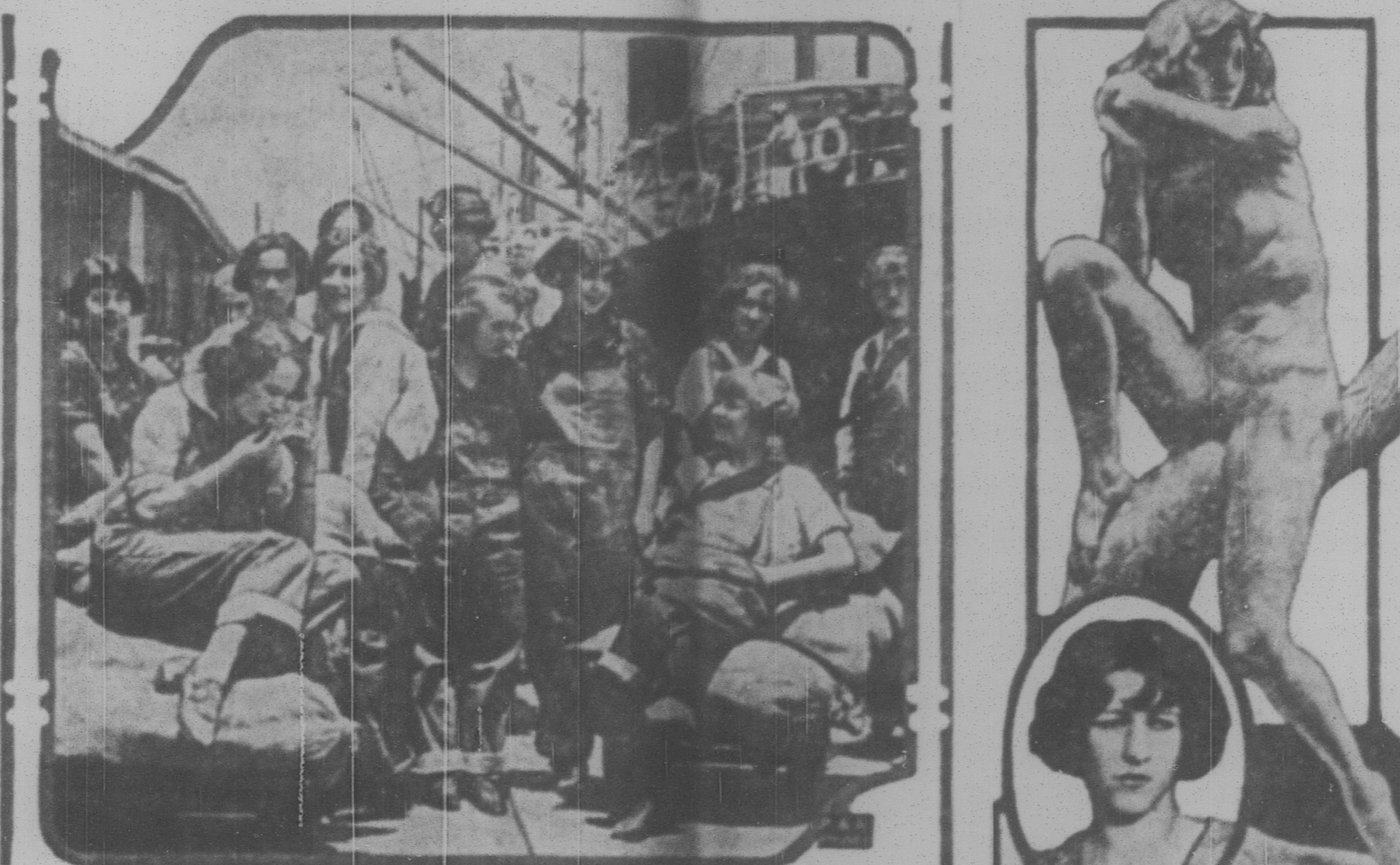
A crowd of pretty girls from southern California high schools and colleges, garbed in overalls, served as stevedores and "longshorewomen" when 600 tons of goods gathered by the Near East Relief were loaded on the steamer Mexican at Los Angeles harbor for transport overseas.