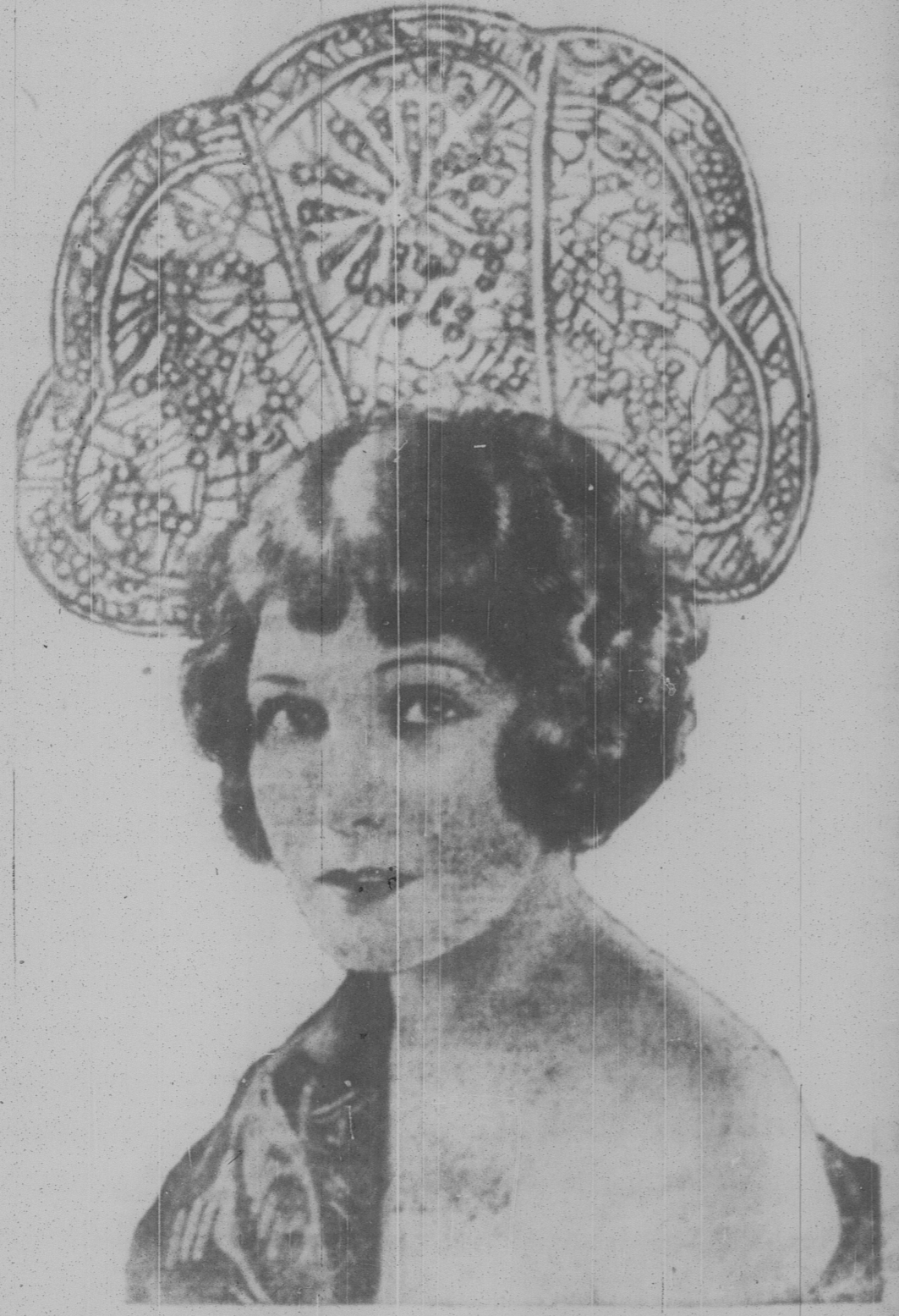
MOST EXPENSIVE COMB IN EXISTENCE This comb, said to be the most expensive in existence, was re- cently presented to Miss Norma Talmadge by a friend. It is be- decked with precious gems. Miss Talmadge stars in "The Wonder- ful Thing," a sterling photo-play, at the Grand Theatre Tomorrow night. It is a picture worth seeing.