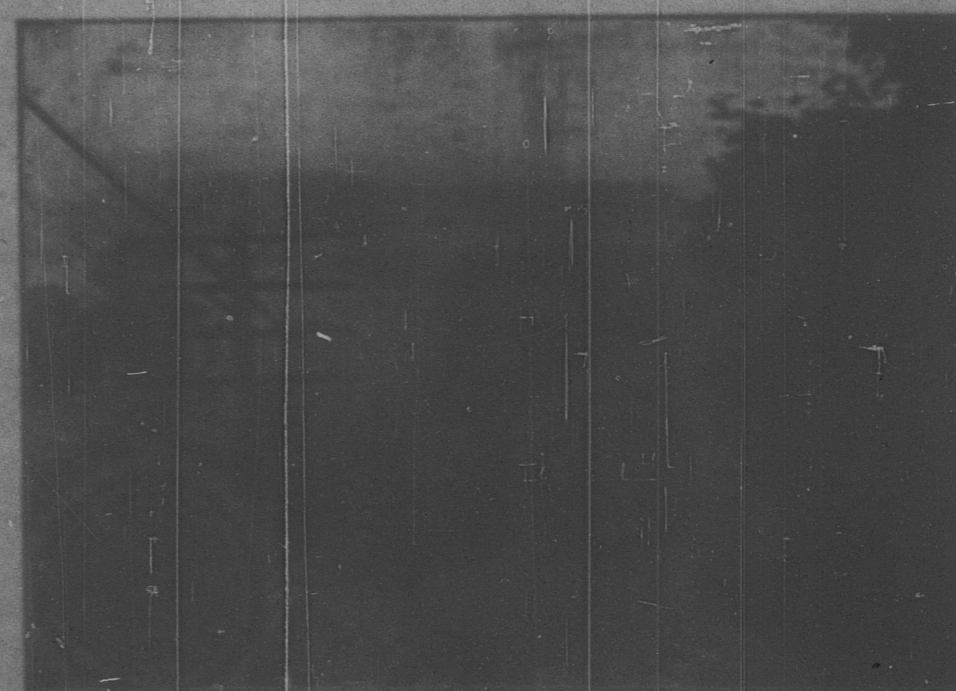
The longest telephone cable in the world, which connects Philadelphia and Pittsburgh. This is where it crosses the Allegheny Mountains, west of Bedford, Pa. The cable weighs over four thousand tons and holds as many wires as could be strung on eight heavy pole lines.