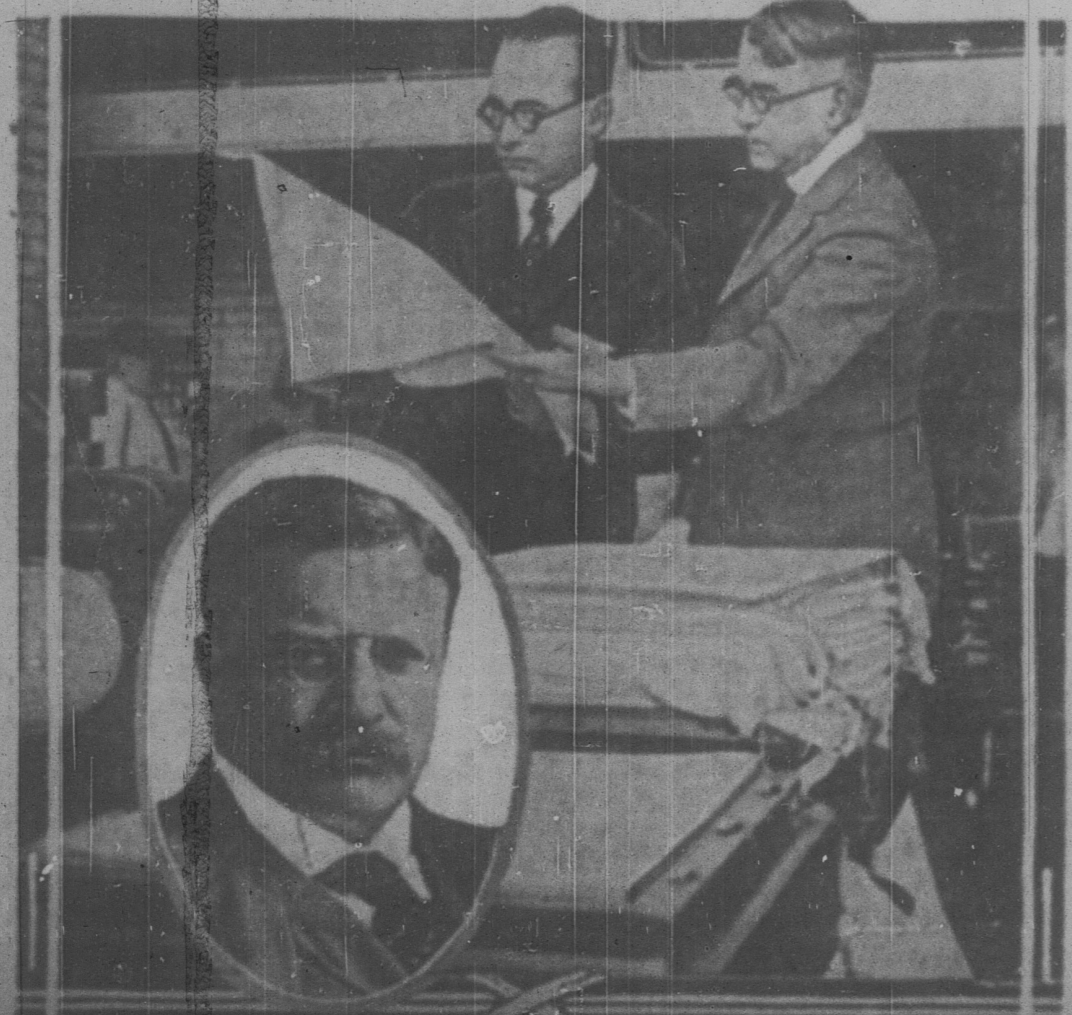
Members of the Bureau of Engraving and Printing inspecting the first printing of the new Roosevelt stamps which were first placed on sale on the 20th President's birthday, October 27, at the Oyster Bay, New York city and Washington post offices. The photograph of the Colonel is one of the last taken of him. His memory was especially honored by the navy, for Oct. 27 was Navy Day.