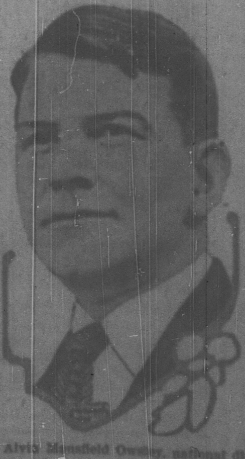
Alvin Mansfield Owsen, national director of the American Legion, who was elected national commander of the Legion at the New Orleans convention.