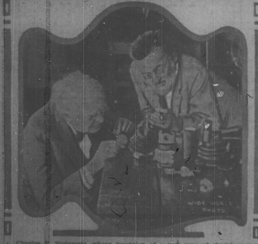
Charles P. Steinmetz, whose invention of a new type of electric motor has just been announced, is here seen in his laboratory in Schenectady, N. Y., showing to Thomas A. Edison the splintered pieces of a tree and portable flashlight which were shattered by his artificial lightning.