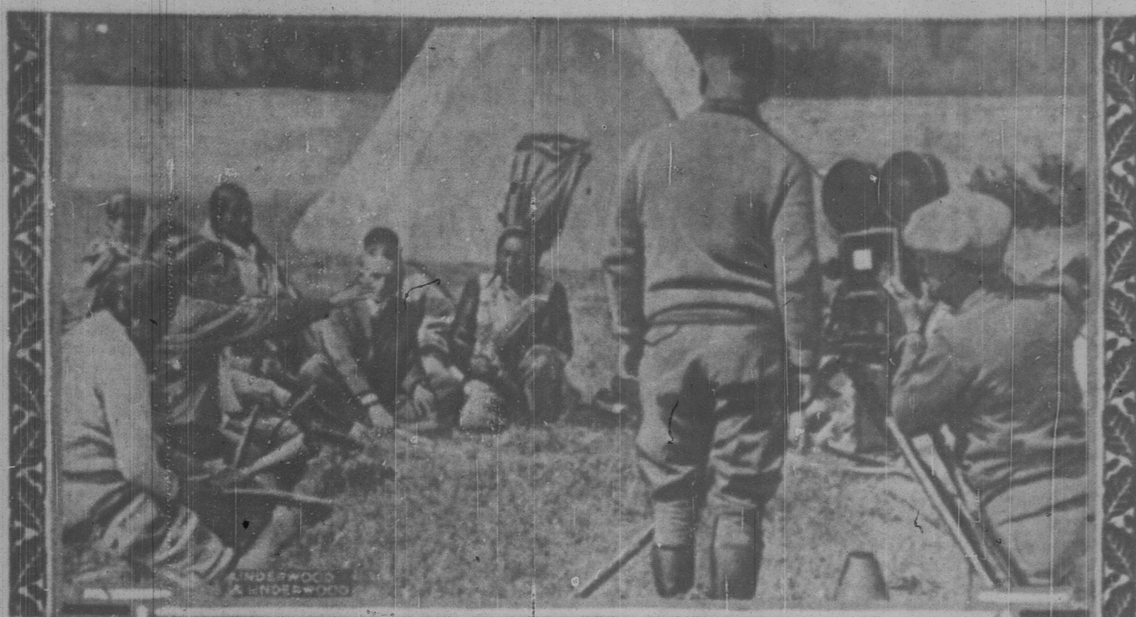
It will be only a short time until the old chiefs of the Blackfeet Indian tribes will have disappeared from the earth. In view of this fact the government has decided to make a permanent record of what remains of their peculiar type of civilization. For the past two months a camera crew has been working in Glacier National park, filming the Indians in their home life, their dances, their tribal gatherings, their sacred medicine ceremonies and other forms of their work and play. The film will be preserved for educational and historical purposes.