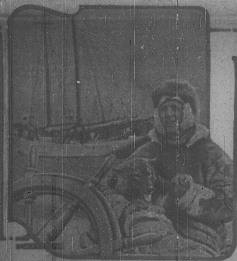
Capt. Donald B. MacMillan, Arctic explorer, and the schooner Bowdoin on which he and his expedition have just returned from an exploration of Baffin Land. MacMillan is holding Sec-ut-muk, one of the dogs that were with the expedition.