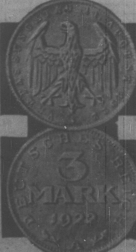
On Constitution day in Germany the first three-mark pieces of currency were distributed by the post. Other currency will follow. The design of the coin is by Professor Quacknorf of Munich.

First American Dental College. The first dental school in the United States was established in Baltimore in 1830.