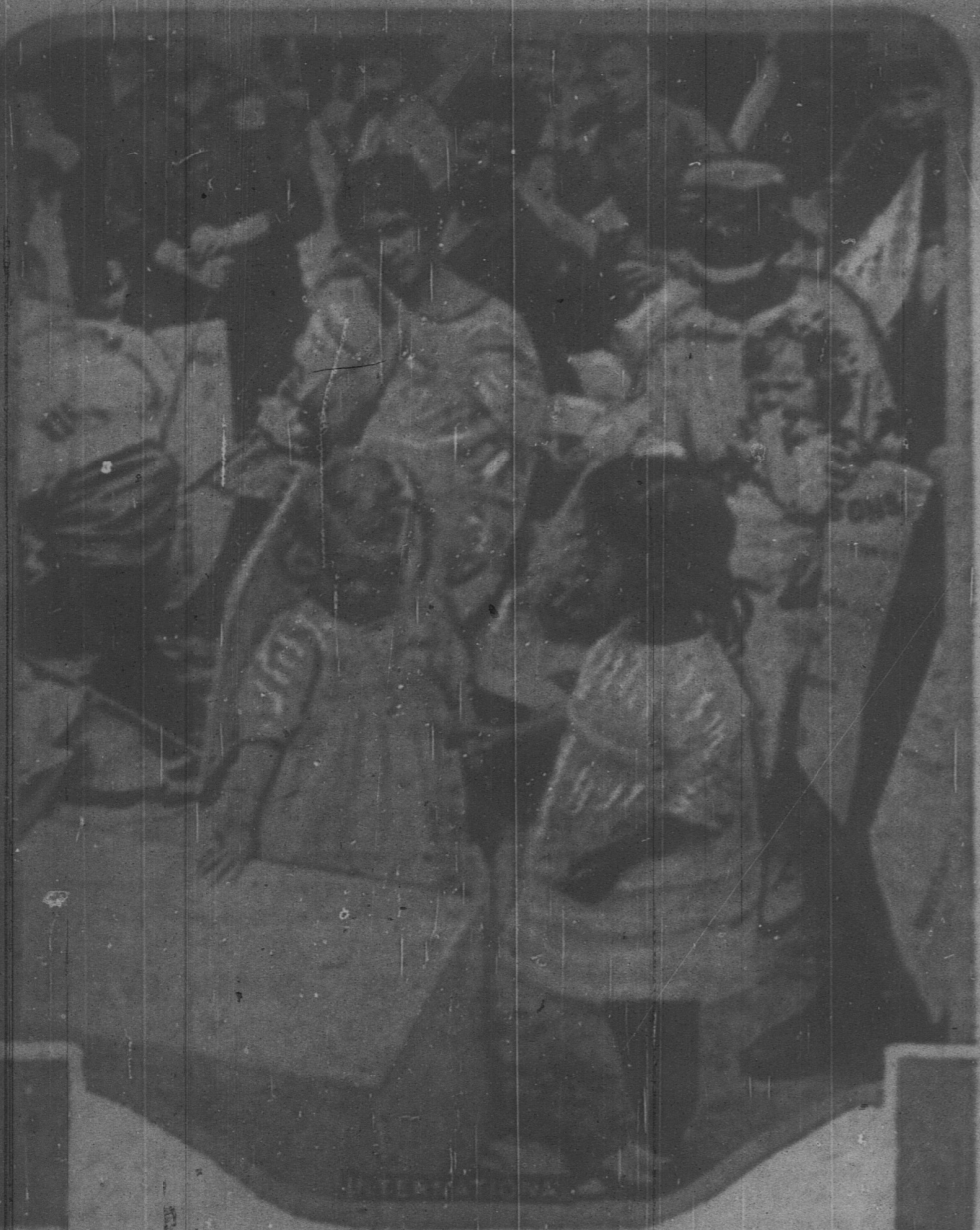
Two of the young children of Solonnes, France, aiding in laying the corner stone for the central milk station erected by Miss Morgan's committee for devastated France. Thousands of youngsters attended the ceremonies and cheered Miss Morgan when she arrived on the scene.