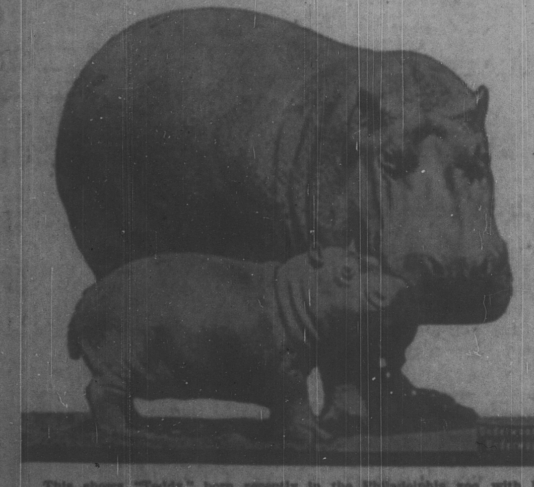
This shows "Toby," born recently in the Philadelphia zoo, with his father, ready to take his first outdoor plunge.