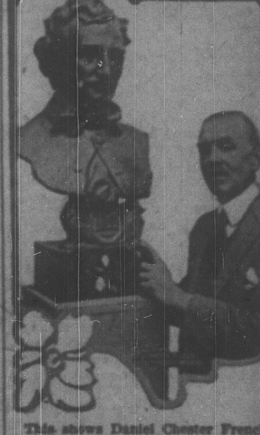
This shows Daniel Chester French who has just passed his seventy-second birthday, with his seventy-completed bust of Edgar Allan Poe, which is to be unveiled May 20 for the Hall of Fame.