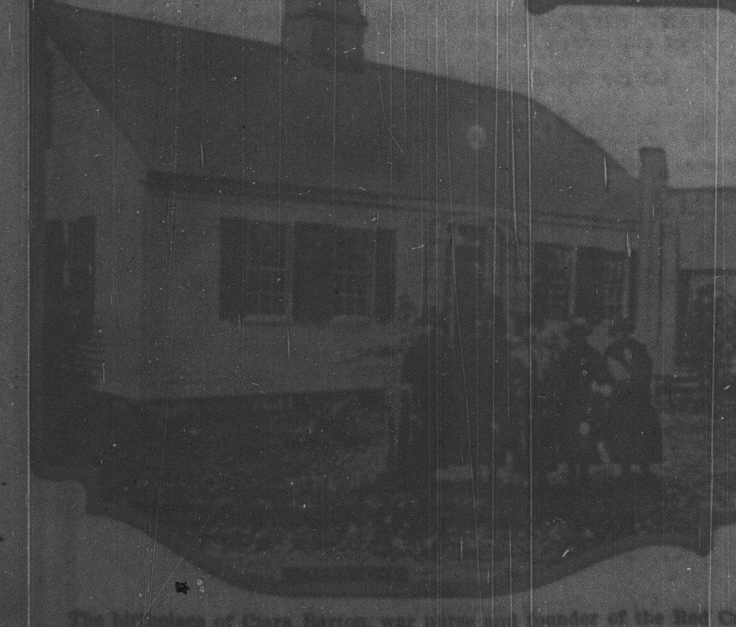
The birthplace of Clara Barton, war nurse and founder of the Red Cross at Oxford, Mass., recently restored by the Women's National Missionary association of the Universalist church.