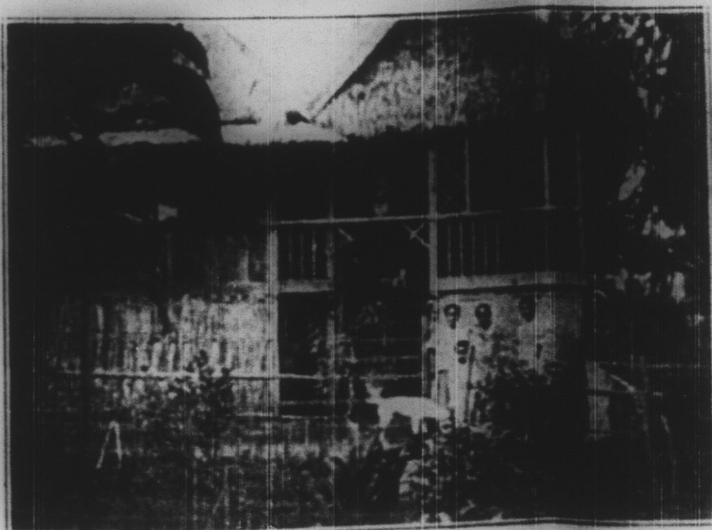
A Typical Philippine Homestead

The United States isn't the only country that has homesteaders—those enterprising pioneers who leave thickly populated districts and take their families into virgin territory to create homes for themselves. The Philippine islands have thousands of sturdy homesteaders.