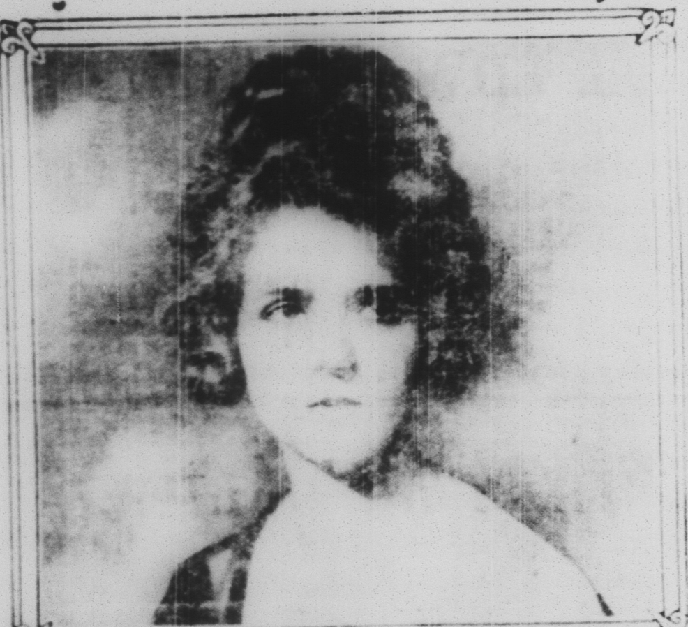
OLIVE THOMAS in SELZNICK PICTURES

Who will appear in the last picture she made before sailing for Paris.