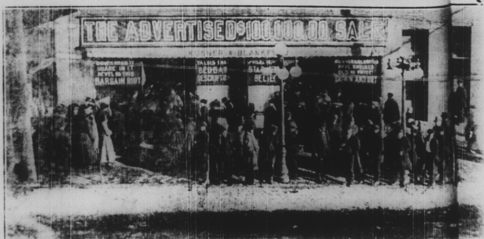
An actual scene at the opening of Kusner & Blankfeld's store last week following extensive newspaper and circular advertising. Advertising will bring profits to you. Keep the columns of the Courier in mind.

products. Write for information where you can get territory. J. R. Watkins Co., Department C, Winona, Minn.