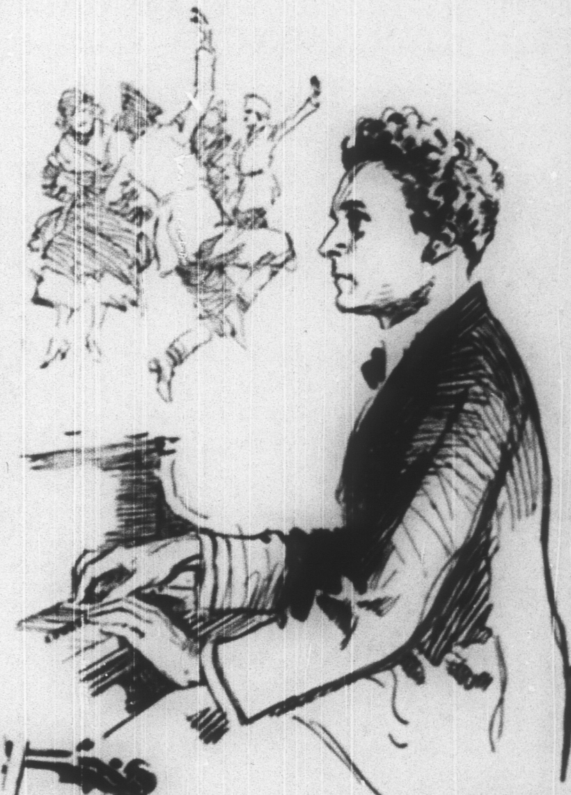
Seidel's Violin Sobs "Eili, Eili"

A marvelous feat of musicianship is this exclusive Columbia artist's rendering of "Eili, Eili," that age-old agonized cry to heaven. Actually human cries of despair, the wailing and sobs of multitudes, are in the tones of Toscha Seidel's violin.