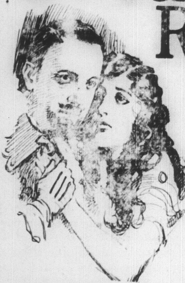
Hackett and Barrientos in Exquisite Rigoletto Love Duet

These exclusive Columbia artists make a marvelous vocal combination in "E il Sol dell'Anima," the matchless duet of the Duke and Gilda from Verdi's Rigoletto . His seductive pleading and her response make this the supreme love aria of one of the greatest of all operas.