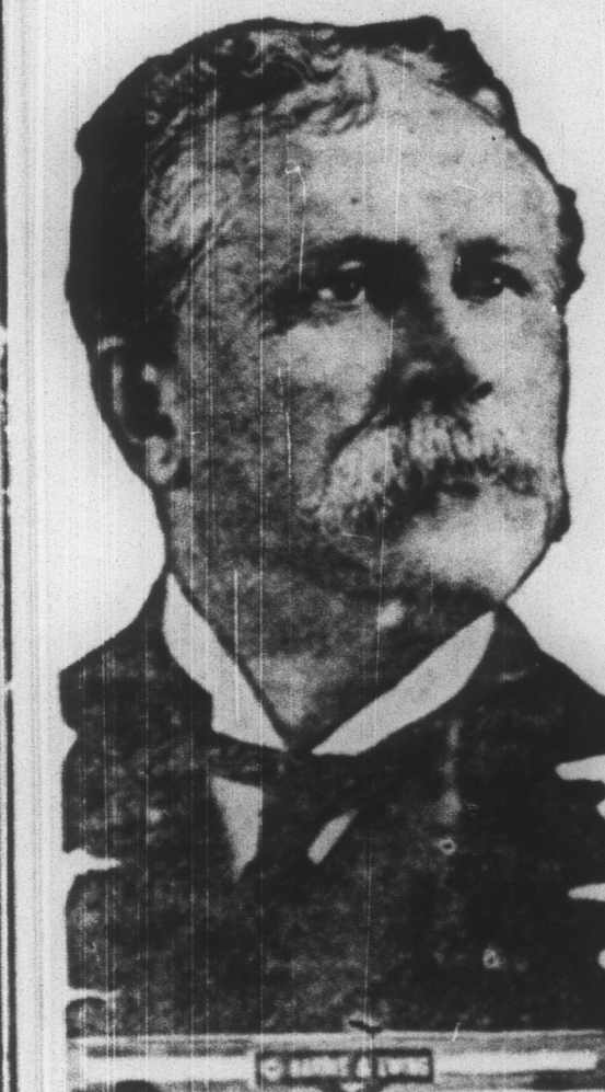
EDWIN C. BURLEIGH

Mr. Burleigh was state treasurer and served as governor of this state four years, from 1889 to 1893. In 1897 he was elected to congress to fill the vacancy caused by the death