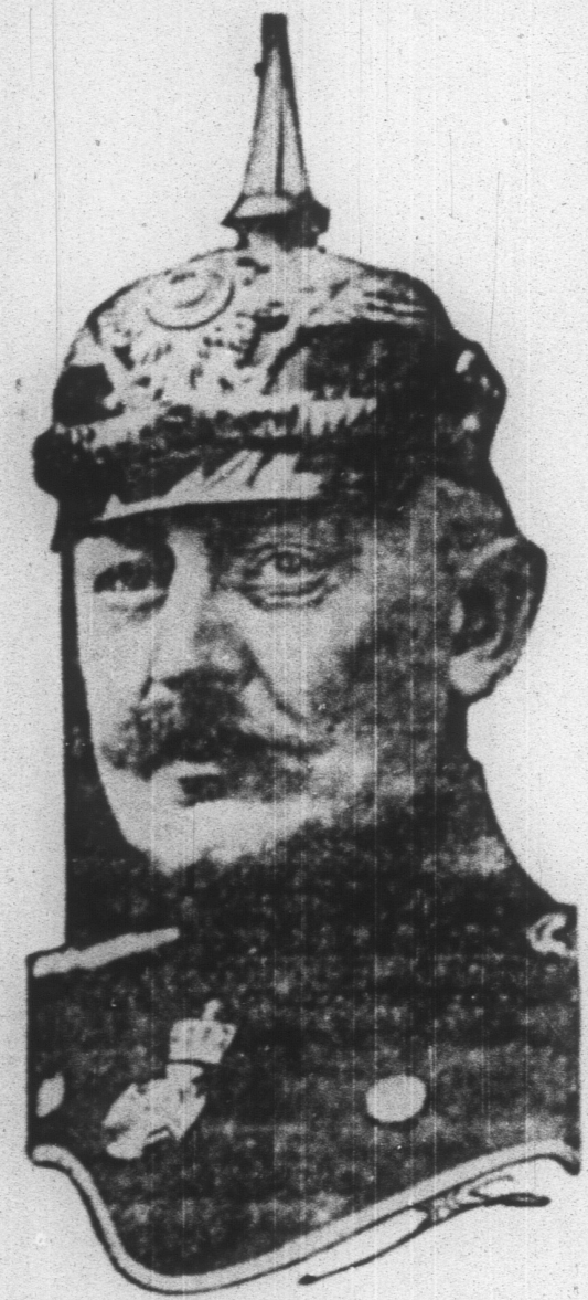
COUNT VON MOLTKE

Amsterdam.—Lieutenant General Count Helmuth von Moltke, chief of the supplementary general staff of the army, died of apoplexy during a service of mourning in the Reichstag for the late Field Marshal von deroltz. Gen. von Moltke was a nephew of the late Field Marshal von Moltke, the great strategist who directed the victorious movements of the German armies when they achieved their me-