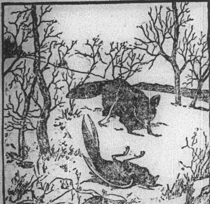
Find the three Daschunds that are tracking the fox.

little brother crept over him to the other side. Then Louis got up and they went on their way.