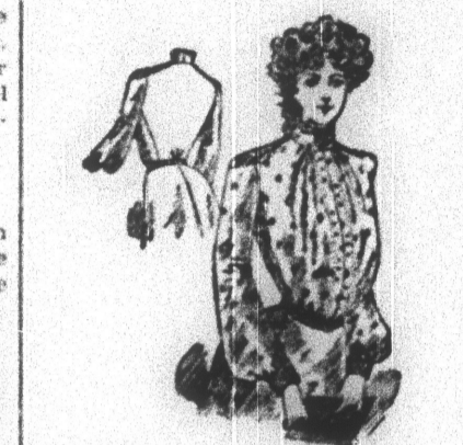
MISSIE'S SHIRT WAIST OR BLOUSE.

New York City.—Simple shirt waists made with the fashionable princess closing are much in vogue and suit young girls to a nicety. The very