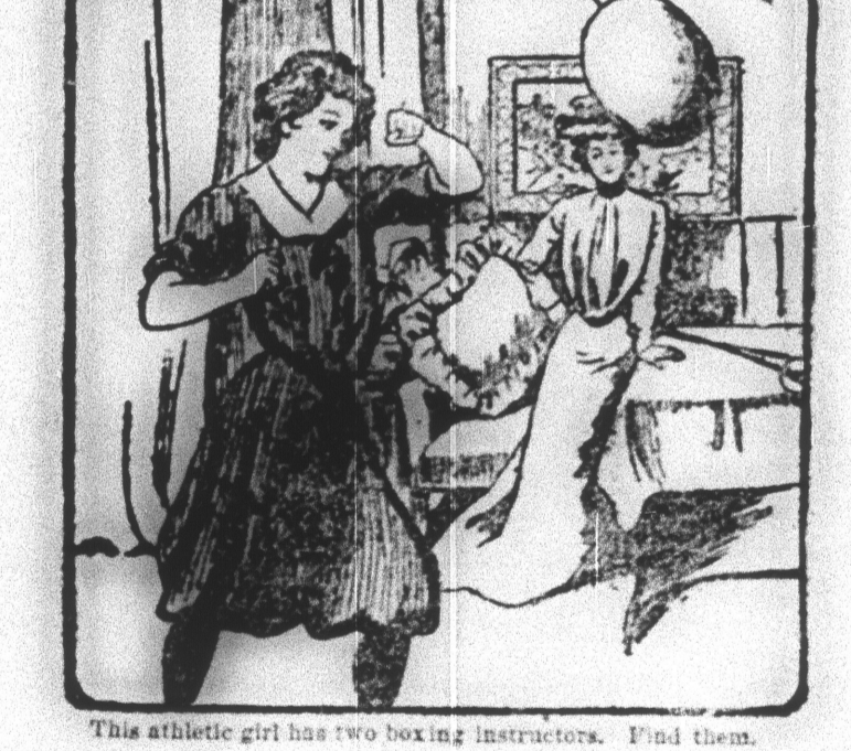
This athletic girl has two boxing instructors. Find them.

another engagement," they said to each other as they went sadly off to bed. The way Miss Mouseie got out of her scrape was very clever.—Chicago Record-Herald.