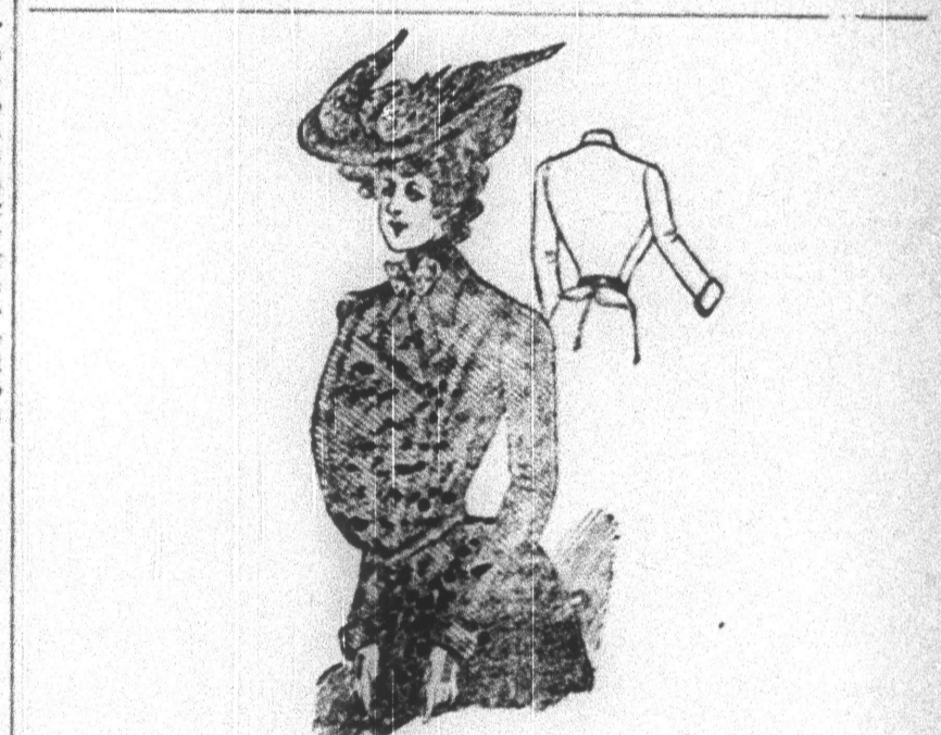
FASHIONABLE BLOUSE JACKET.

Spot seam effects are seen upon the latest waists and gowns and are exceedingly effective. The very stylish May Manton illustrated shows them used to advantage and in conjunction with tucks at the shoulders and the princess closing in front. The