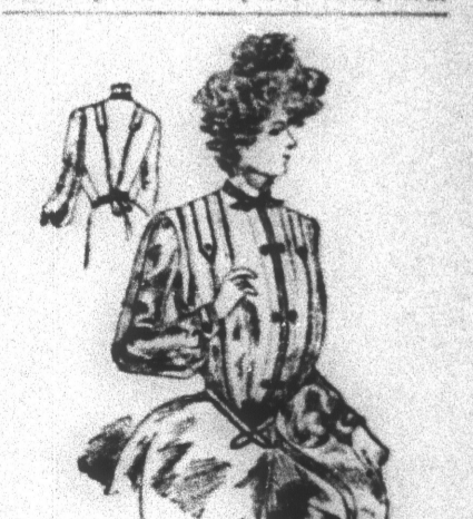
BLOUSE OR SHIRT WAIST.

The lining is snugly fitted and closes at the centre front quite separately from the outside, but can be omitted whenever an unlined waist is desired. The waist proper consists of fronts and back, which are laid in inverted tucks that are stitched to give the spot seam effect from the shoulder to the waist line, the fronts also including additional tucks at the shoulders, that are attached to yoke depth, and the front edges being laid in wide tucks that meet over the bosom through which the closing is made. The back is finished with a novel stock and at the waist is a belt with position straps in centre back. The quantity of material required for the medium size is four and three-eighths yards twenty-one wide, four