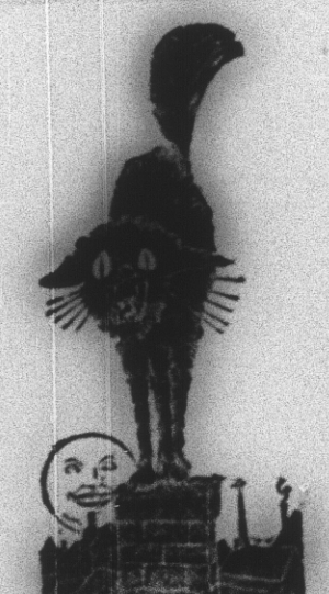
Some Dark Night

which politics have nothing to do, and Mothers every where praise One I shall demand a retraction of this Backache should never be neglected. Minute cough cure for the sufferings false statement in every quarter where