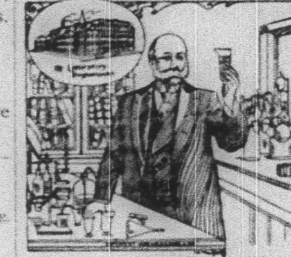
The Discoverer of Swamp-Root at Work in His Laboratory.