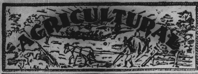
Clover For Poultry.

Some sort of green food is absolutely necessary for omnivorous fowls, and clover seems to be more to their taste than any other vegetation.