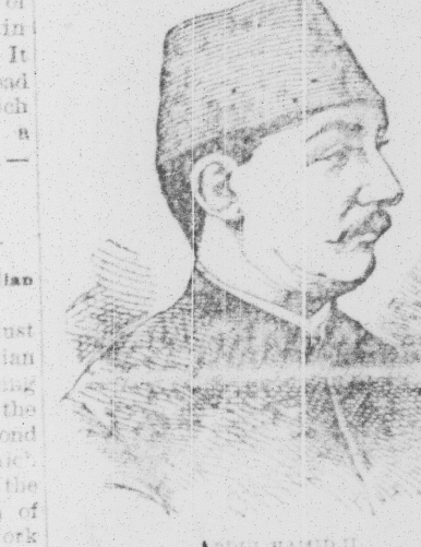
Portrait of a man.