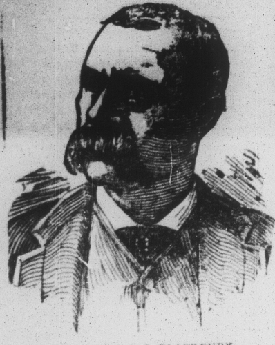
SENATOR J. C. BLACKBURN.

A Skin Specialist Is to Graft New Hair on a Chicago Broke.