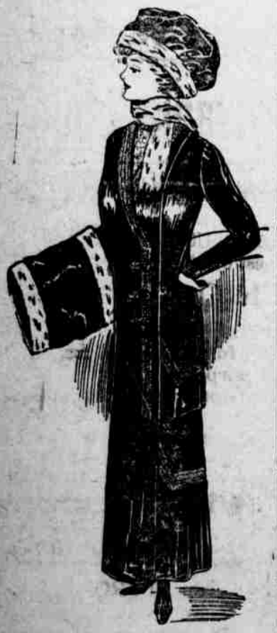
Velveteen Walking Costume.

The skirt has the braid carried from the front panel round the sides