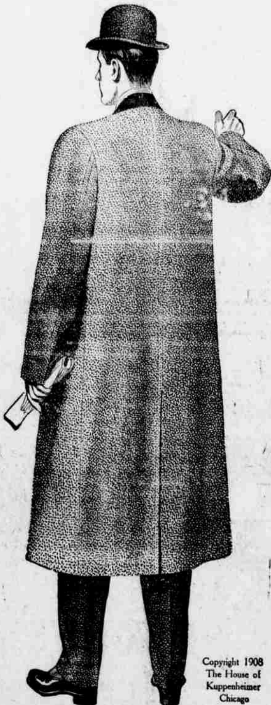
Copyright 1908 The House of Kuppenheimer Chicago

See the Back; See the Fit of Collar; See the Swagger Hang of the Back